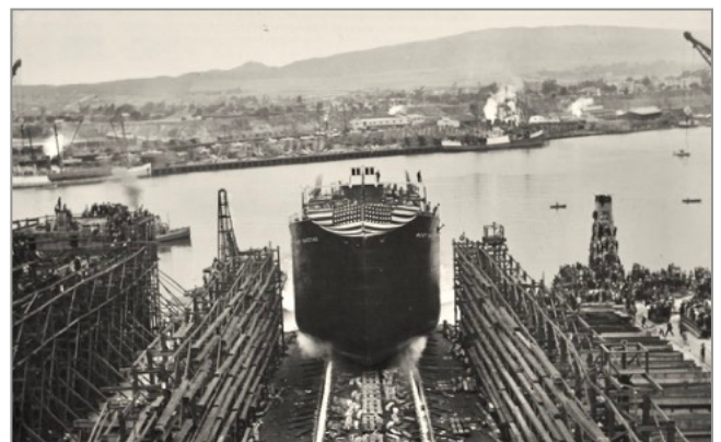
Launch of the SS West Chetac at Southwestern Shipbuilding on Terminal Island, 1919