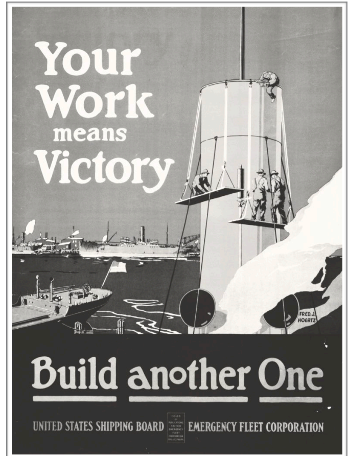
World War I Era poster promoting shipbuilding

On October 20, the SPBHS Archives will make its debut as an exhibitor at the LA as Subject Archives Bazaar. This one-day event, hosted in USC's