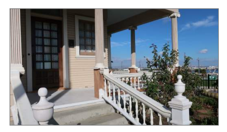
Restored banisters and railings, new finials and newel posts await more primer and top coats of paint.

For 2020, we hope to have the Muller House and its garage repainted and the landscaping renewed with colorful, drought-resistant plantings.