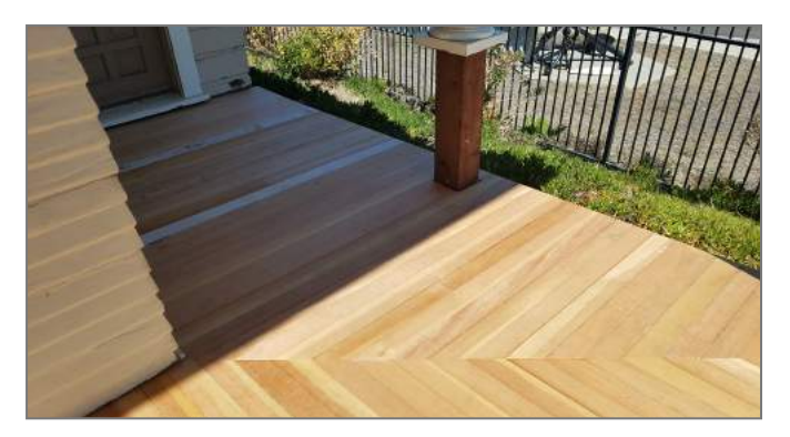
A section of new cedar decking before primer paint and before side rails were installed.

The project activity at the Muller House Museum has generated interest from passersby and neighbors.